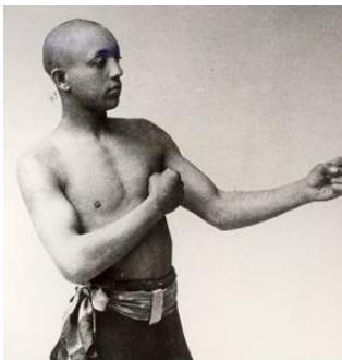
Panama Al Brown